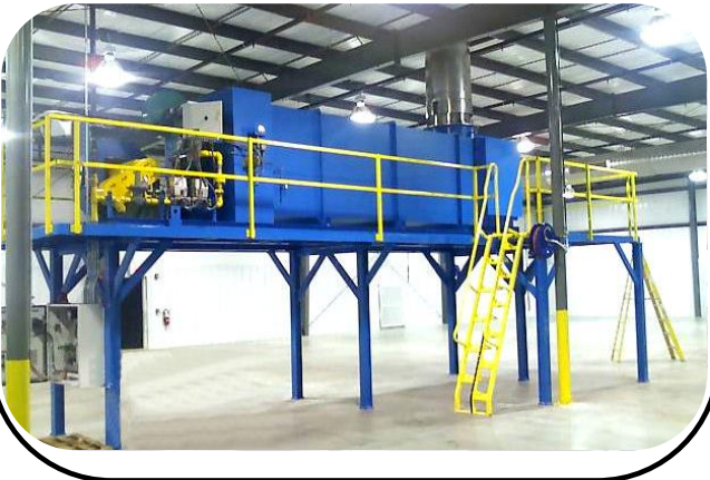
Below: S&B oxidizer installed at Bontex.

"We rely on Stelter & Brinck's machinery and staff to keep things running and they do- therefore, we don't have the frustrations and costs of downtime. This allows us to provide quality products to our customers on-time, every time."