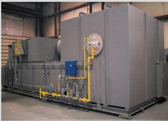
Stelter & Brinck's Thermal Oxidizer, built for Veyance Technologies

"I would recommend S&B; they make my life easier! It's as simple as that!"