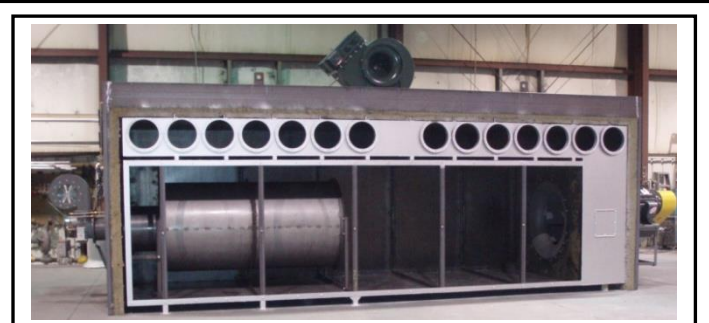
The high-tech heart of the curing oven at Stelter & Brinck's facility prior to shipment