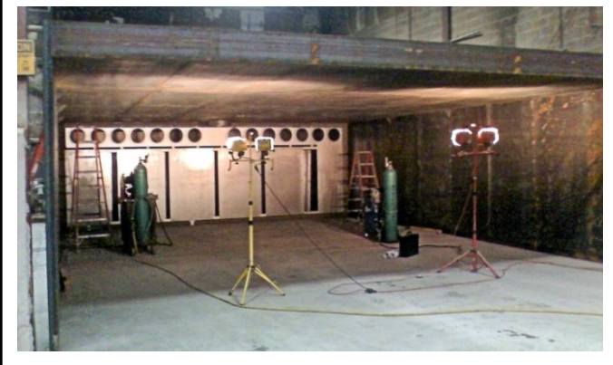
The oven in the process of being installed at CCPI