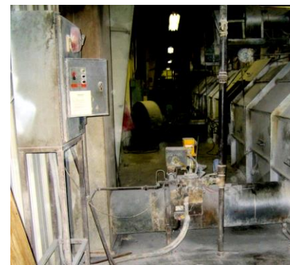
Oven Zone 1 of 10 Before