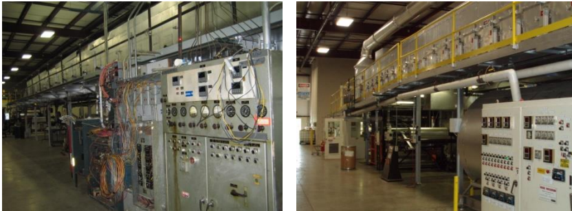
Left: Old coating line. Right: New line S&B upgraded, installed & commissioned.

If you have combustion equipment that is in disrepair, out dated or that needs upgrading, we can help. Backed by our engineering department, a team of experienced technicians can upgrade or rebuild your combustion equipment to today's codes and standards.