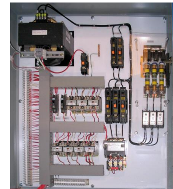
After S&B Upgrade