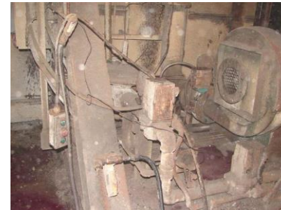
Combustion System Before