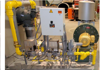
After S&B Upgrade