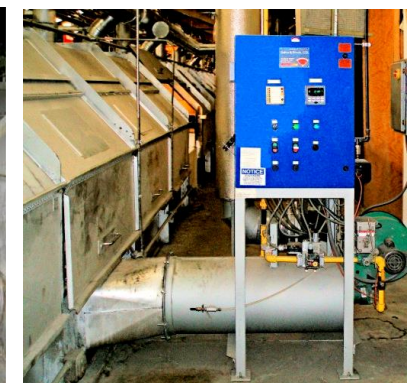
After S&B Upgrade